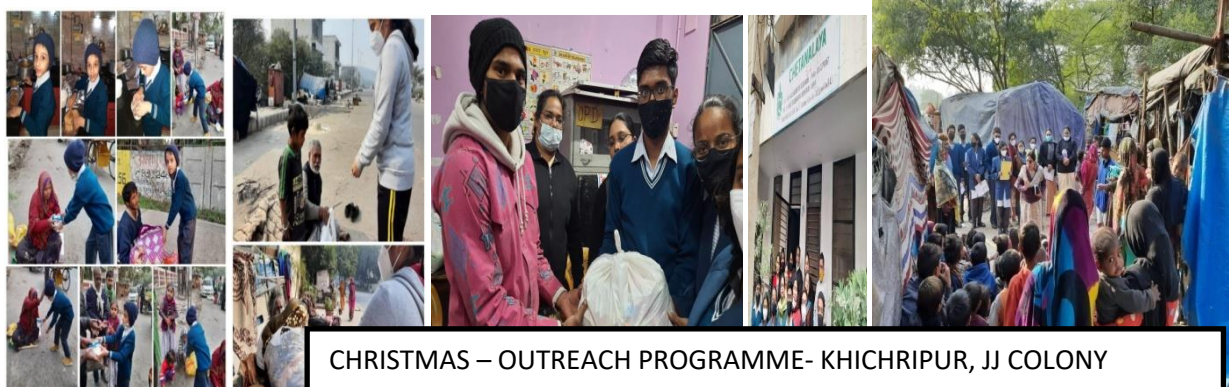
CHRISTMAS – OUTREACH PROGRAMME- KHICHRIPUR, JJ COLONY

Special Effort: -Our school has adopted a village KICHRIPUR JJ COLONY. A few students and teachers along with our JPIC facilitators visited this slum as part of our Christmas outreach programme. This was a small initiative through which our students became aware of their surrounding conditions. Through their interaction with them, students have created awareness about hygiene and the need of education. A few glimpses of our activities are here below